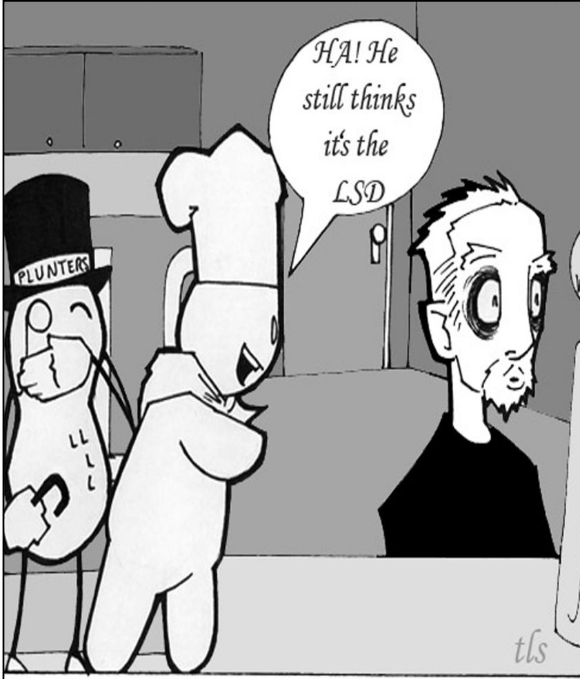
Life at Timothy Leary's house

So why? Why is it so hard to say goodbye? I don't know, but I do know that I don't like it.