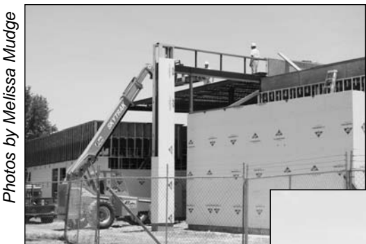
The new Scharbauer Student Center and right, the new gymnasium under construction for the Physical Education expansion

The goal of this course is to assist students with a passion for poetry and creative writing to write more! Students will be encouraged to create a new, more personal body of work. The course would end with a small reading of the works written during the workshop, and each student will be responsible for presenting a final chapbook at the end of the course. The course costs $75 and will meet 6:00 - 8:00 p.m. on Thursday evenings from June 4 - July 16. To register, please visit us online at www.midland.edu/cpe/courses or call (432) 685-4518.