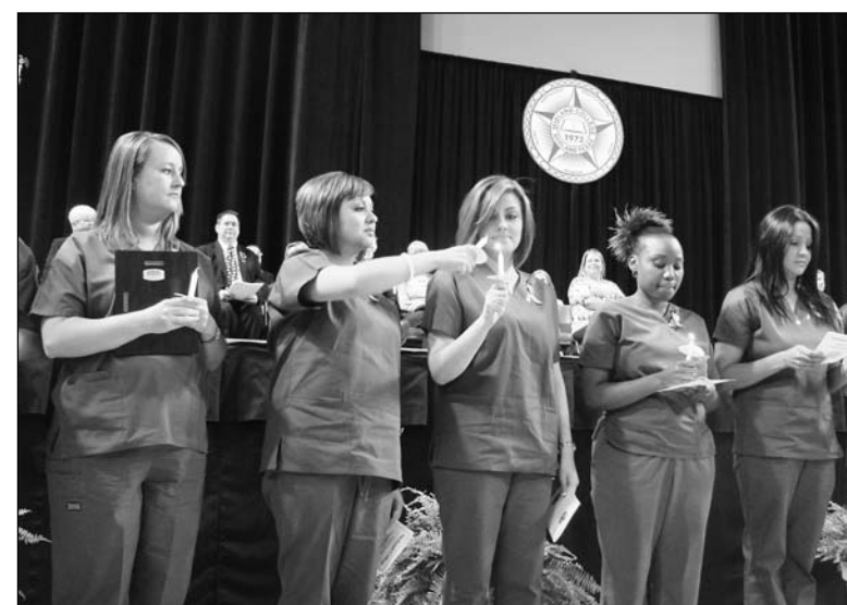
Nursing graduates light their candles at the pinning ceremony on May 6